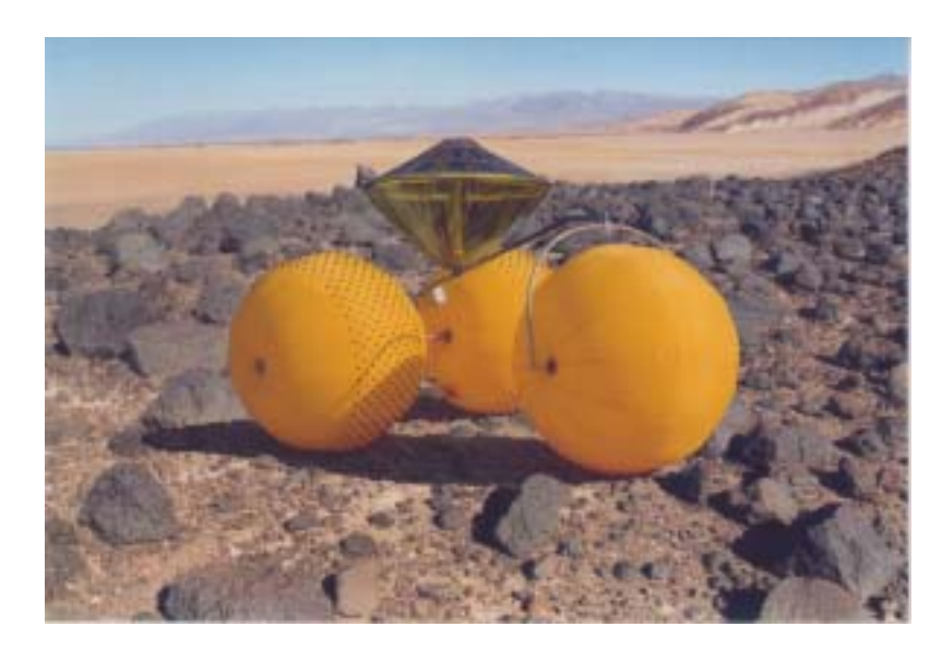
The "Big Wheels" inflatable rover doesn't mind a few boulder-sized rocks, no matter what planet they're on!

This article was provided by the Jet Propulsion Laboratory, California Institute of Technology, under a contract with the National Aeronautics and Space Administration.